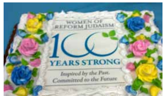
The Past Presidents of Women of KI/Sisterhood were honored at a Shabbat Service in May.